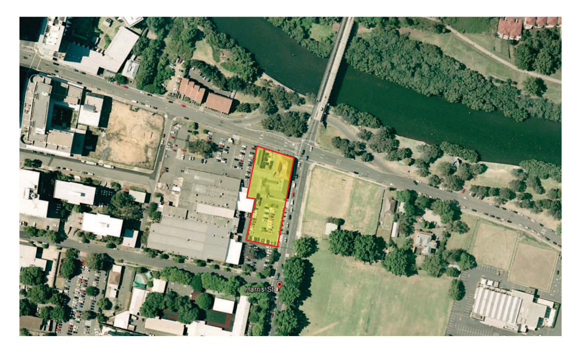
Figure 1 — Aerial photograph showing site and context. North at top of page. The adjoining site to the west is the subject of a separate Planning Proposal for future redevelopment