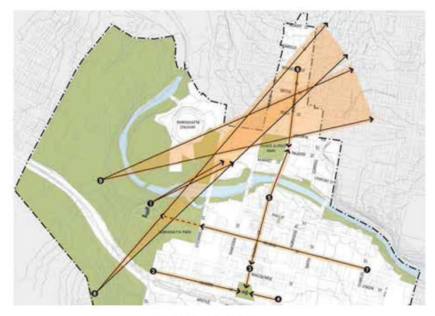
Figure 4.3.3.4. Historic Views

Figure 4.3.3.4. (page 240) of the Parramatta Development Control Plan 2011 [PDCP2011] defines nine 'historic views'. None of these would be impacted upon by development on the subject site. View 7 describes a view along George Street to Parramatta Park gatehouse and trees. However, this view is unidirectional west from the junction of Charles and George Streets so is both some distance from the site and looking away from it.