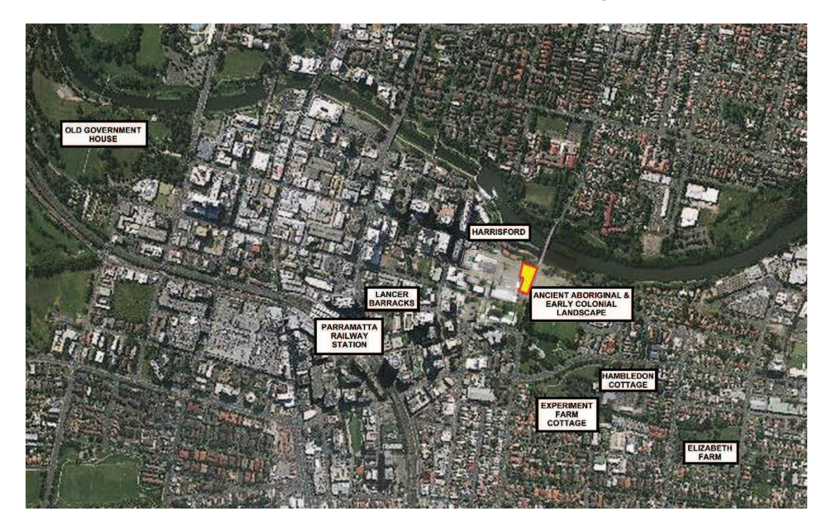
Figure 2 — Aerial photograph showing site in the context of heritage places of high significance. North at top of page.

Places on the SHR further afield include 'Elizabeth Farm' to the southeast and the Parramatta Railway Station and Lancer Barracks to the southwest and Old Government House to the West. The Planning Proposal Design Report recommends a substantial increase in the permissible height on the site. Consequentially, visual and shadowing impacts of these sites has been considered to ensure that the proposal would not have an unacceptable impact on their identified heritage values.